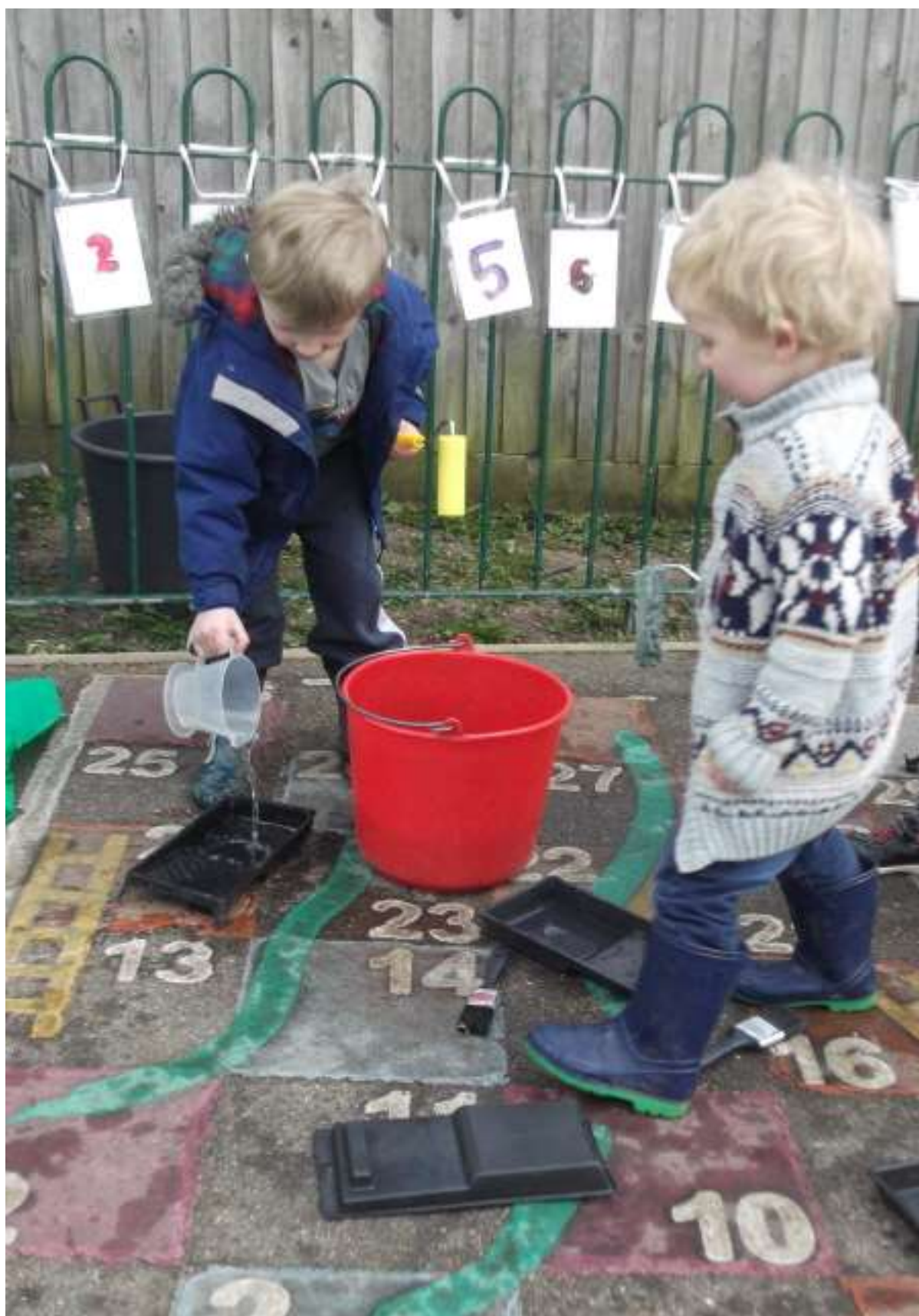
OUTDOOR PLAY - WATER