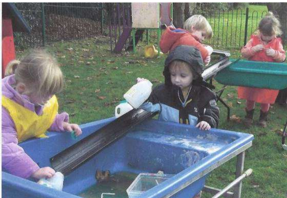
SHERINGTON PRE-SCHOOL Messy outdoor play !