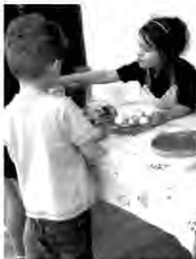
Snack Monitor serving fruit & toast

"Children are highly independent. They competently serve their own snacks and put their coats on ready for going outside... they are gaining the key skills in readiness for school."