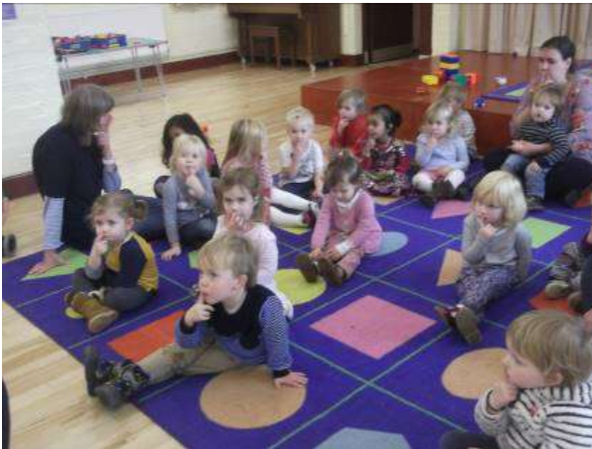
The children observing the minute silence in respect of the fallen soldiers for Remembrance Sunday

We return after the Christmas break on Tuesday 5 th January. On behalf of us all at Sherington Pre-School I would like to wish you all a very Merry Christmas and a Happy New Year! See you all in 2016!