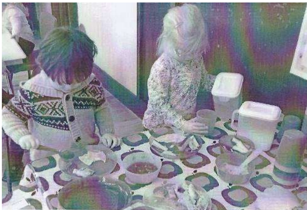
Tasting poppadoms and mango chutney for Diwali week.