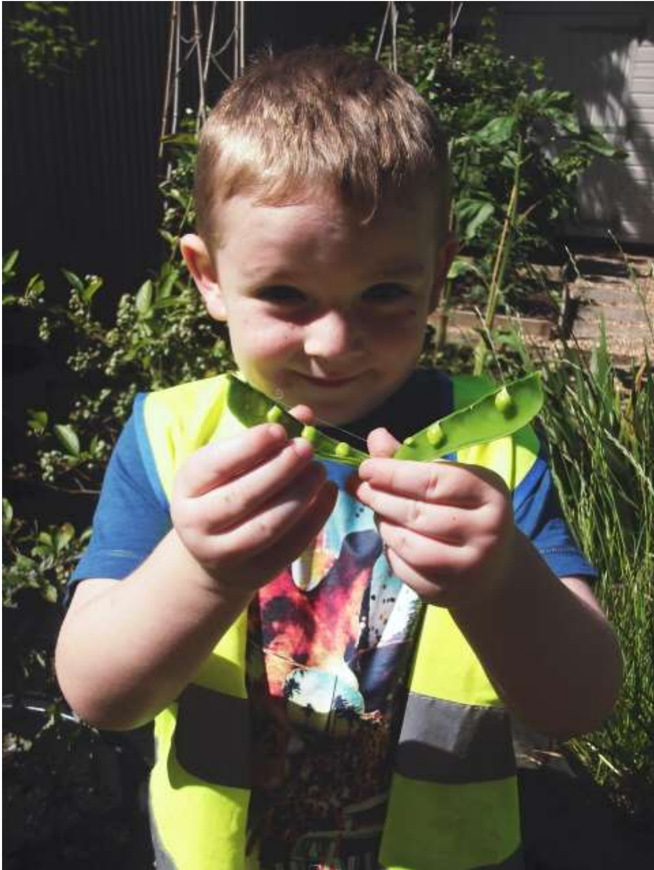
Freshly picked peas!