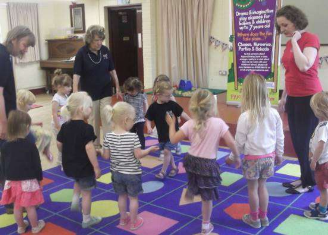
Playing Snail Game