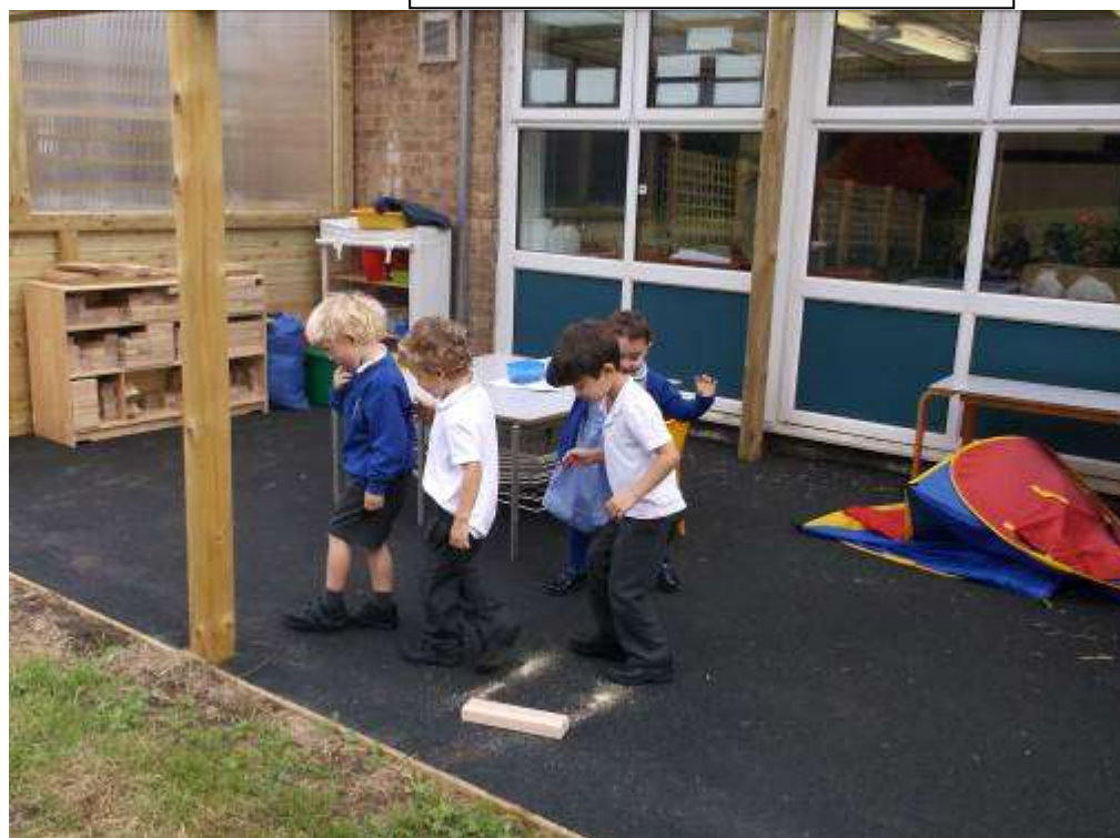
Enjoying outdoor activities under the new canopy