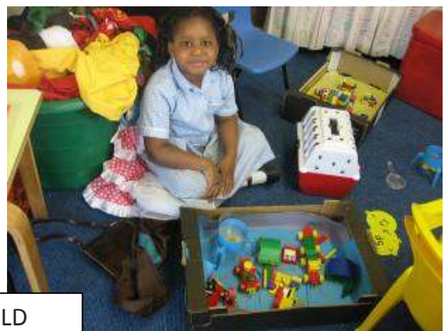
MY SMALL WORLD